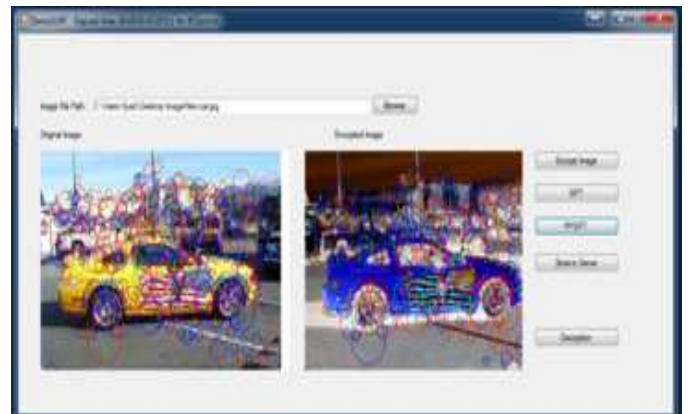
Fig. 4 Comparative Features of Original and Privacy Image