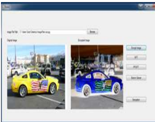
Fig. 1 Data Set for Proposed system